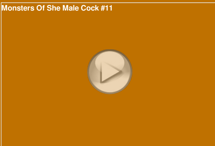
Monsters Of She Male Cock #11